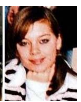
Teenage Gunman who Massacred 16 in School Killing Spree Shot Himself Dead March 12, 2009

http://www.dailymail.co.uk/news/worldnews/article-1161139/