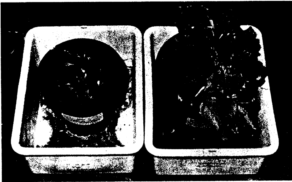
Fig. 1. The lettuce plants in the pot at the left were watered with tap water; the ones at the right, of the same age, were watered from a densely populated aquarium.