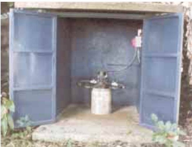
Casa Corcovado Lodge gets 410 watts from 60 gallons per minute at 148 feet of head.

Capacitor substitution for the initial values will correct phase imbalances if they exist. It is very helpful to have industrial electrical experience for this process, but handy people with a good knowledge of electricity can usually muddle through it. A selection of motor run