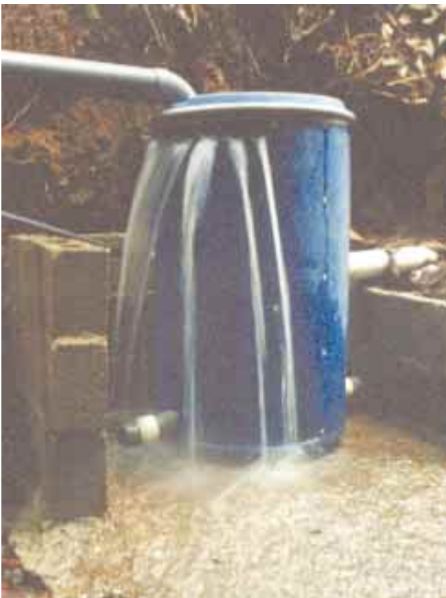
German Llano's filter tank, at the top of 55 feet of head, provides a clean 73 gallons per minute.

See the rpm selection chart for induction motors used in battery charging systems. It assumes that the turbine runner diameter is four inches (10 cm). Try to stay as near as possible to the "ideal" shown in the chart. These ranges need to be experimentally verified under laboratory conditions, especially the minimums and maximums. Is any reader out there looking for a university thesis project?