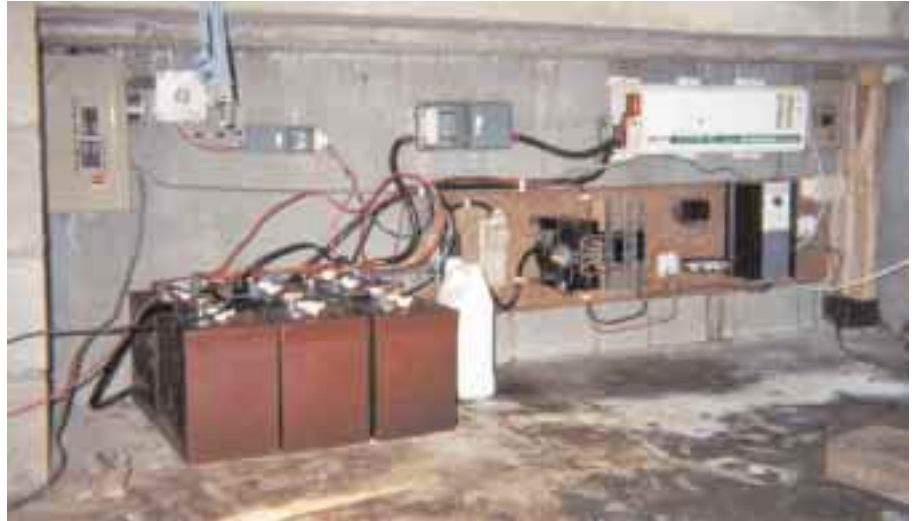
The Bosque del Cabo system utilizes a 1 1/2 HP motor (left) to produce 180 watts from 21 gpm at 190 feet of head. 2,300 feet from the hydro unit, the rest of the system (right) steps down from 415 VAC to 12 VDC.

motor design is meant to withstand many years of industrial use and abuse. There are no brushes, slip rings, diodes, or wire windings on the rotor to fail.