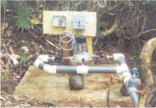
The Buena Vista Lodge uses a 1.5 HP motor to generate 370 watts from a three-nozzle pelton wheel.

this position. If the current is lower than in your first measurement, return the connection to point 3.