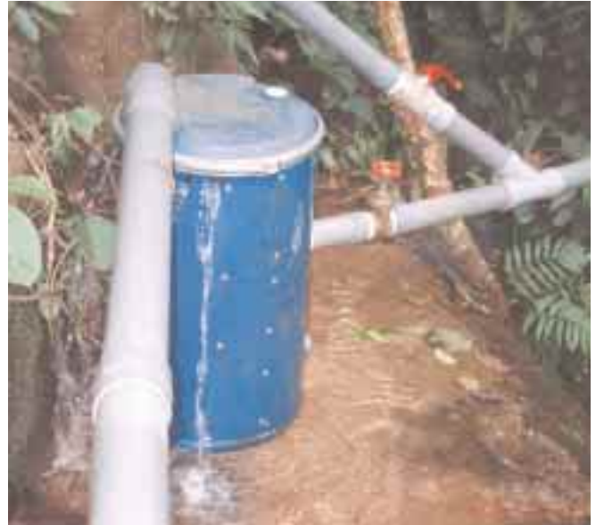
A typical filter tank at the top of the Lebos' penstock.

The complete hardware package of an assembled turbine for a 1 1/2 HP motor—induction generator, capacitors, capacitor enclosure, fuses, transformer, and rectifiers—will cost about US$2,000 to $2,500. Where