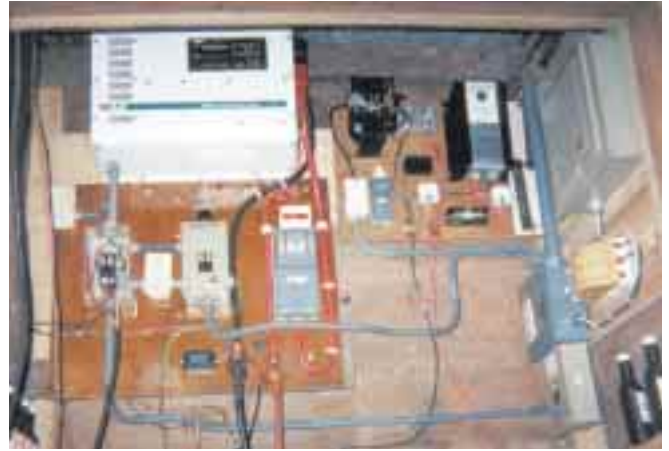
415 VAC becomes 24 VDC at Buena Vista's power center, 2,500 feet from the Harris hydro unit.

capacitors is necessary for maximizing machine output. This is a fairly significant cost outlay—about US$200—and you will end up with some extra capacitors when you're done.