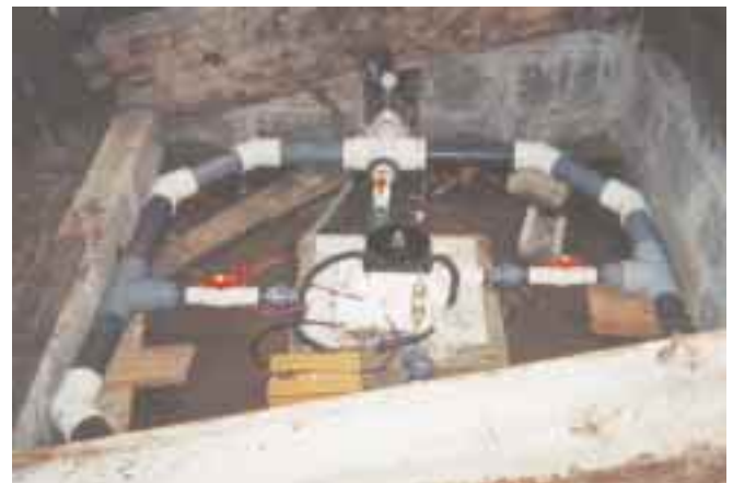
Llano's ES&D 28 volt DC alternator acted as the control group in the comparison of AC induction generators.

Technical information on selection, purchase, setup, installation, and maintenance of induction generators is difficult to obtain. Very few publications exist describing this useful technology. The exception is one excellent book, still in print, from IT Publications in England,