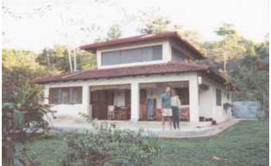
Joel Stewart and Belan Momene are building a hydro-powered lodge. Currently, their system provides 15 KWH per day.

Stand-alone induction generators have difficulty running inductive loads such as motors. A stand-alone induction generator directly runs the loads and does not use batteries or an inverter. These systems require more sophisticated electronics to operate, in the form of a load controller with ballast resistors, which hold the voltage and frequency near 60 Hz 120/240 volts. The motor load inductance reacts with the generator's excitation capacitors, causing the voltage to fall and the frequency of generation to rise. If too large an inductive load is connected, it will cause the generator to lose excitation. To correct this problem, motors run directly