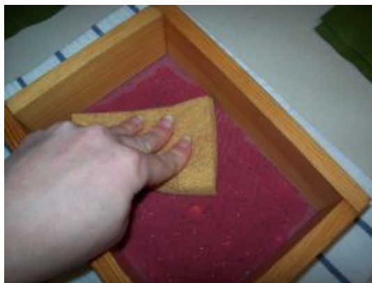
Step 7: Use the sponge on the screen to remove excess water.