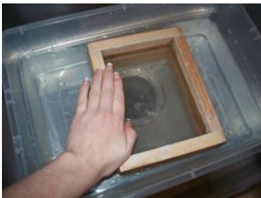
Step 4: Hold the deckle in the water with one hand.