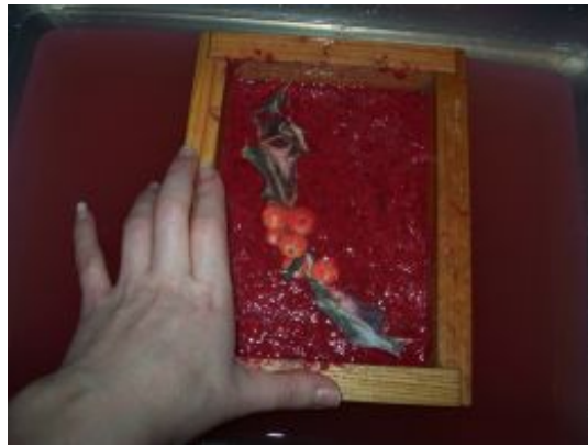
To add a picture, simply place the photo on the pulp while it is still under water.