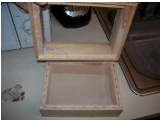
Step 1: See the two parts of the deckle, the larger part is the top.