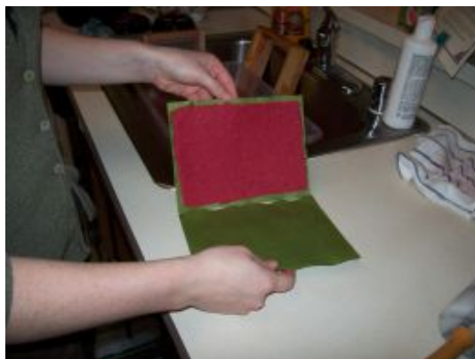
Step 8: Flip the pulp and blotter over onto a dry blotter page.