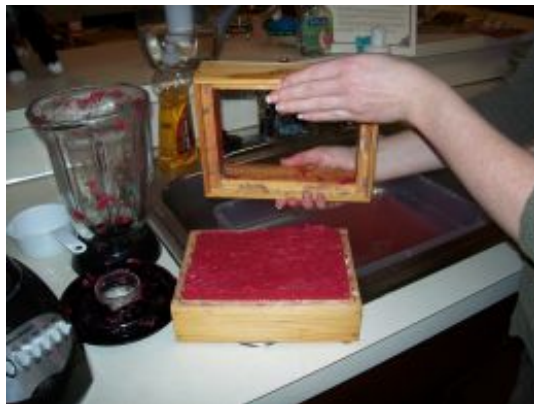
Step 6: Remove the top of the deckle.