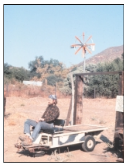
Wind-generated electricity was used to recharge Ox.

plugging a car into one of my windelectric machines. A few months later, this dream came true with Ox, my first EV. I was driving on wind-watts! I had found an alternative to the ICE car and gasoline.