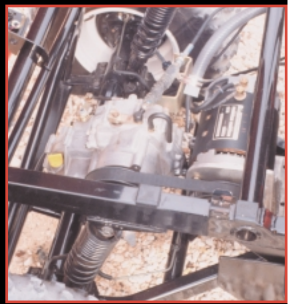
A gearbelt delivers motor power to the stock transmission, eliminating the less eifficient infinite ratio drive unit.

What did it all cost? The basic conversion kit ($2,160), battery pack ($600), DC-DC converter ($190), and miscellaneous hardware and aluminum angle ($250) totaled $3,200. Add to this 30 hours of Tom's time. And this was a prototype!