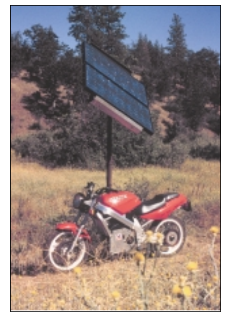
Solar panels recharge an electric motorcycle miles from grid power.

My research also revealed that, in 1900, steam cars and electric cars had dominated the roads. An electric-powered vehicle? I daydreamed about